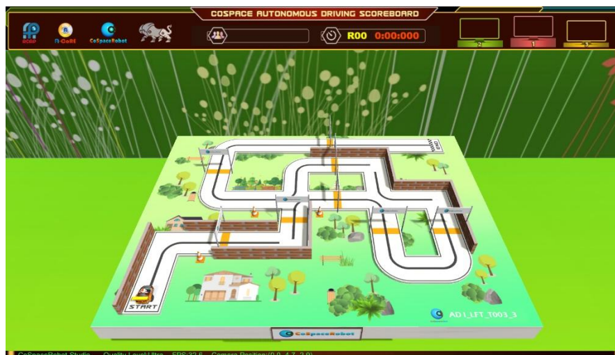
Figure 7: VIRTUAL_WORLD Layout