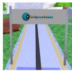
Figure 3: Example of a gantry