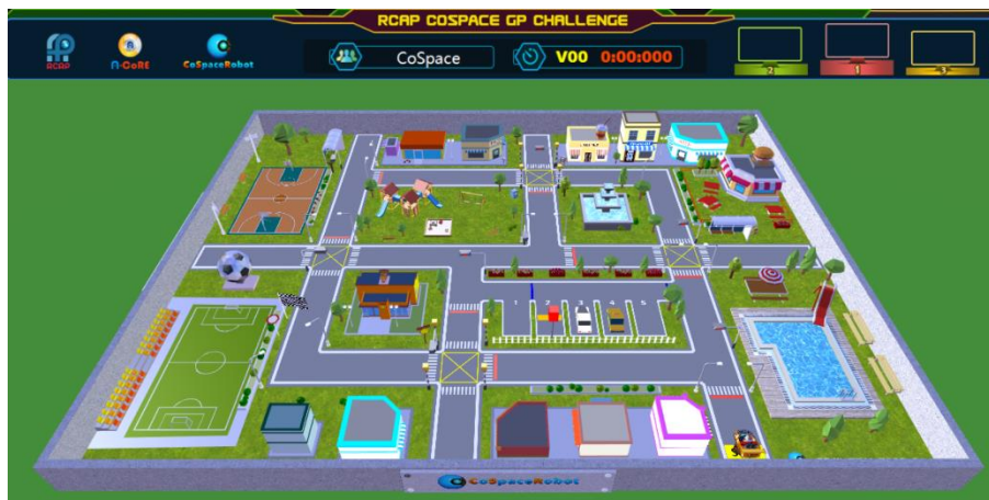
Figure 2: CoSpace Grand Prix Challenge (iCool), U19

In the CoSpace Grand Prix Challenge (iCool), students are only required code a virtual robot, and finally take part in the Grand Prix Challenge (iCool). The maximum stay in virtual world is 8 minutes.