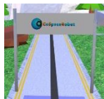
Figure 4: Example of a gantry

Gantry is an overhead assembly on which certain signs or signals are posted. Gantry will not block the road. The design and colour of gantries can be varied.