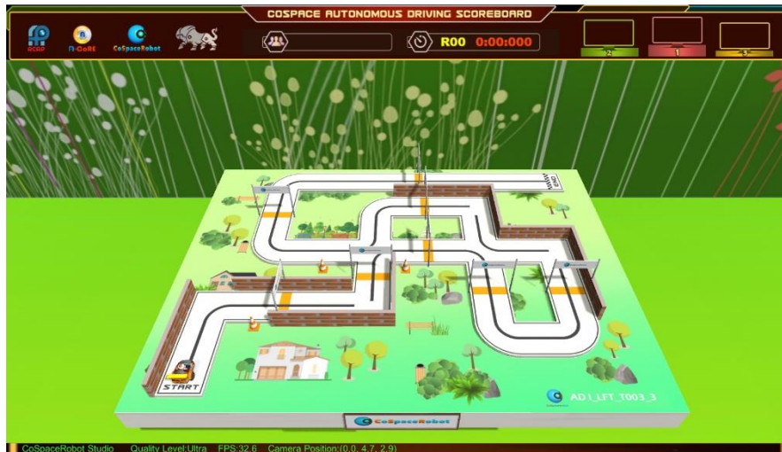
Figure 2: CoSpace Autonomous Driving Challenge (online), FirstSteps

Video Link: https://youtu.be/sEgVYDuOmCY