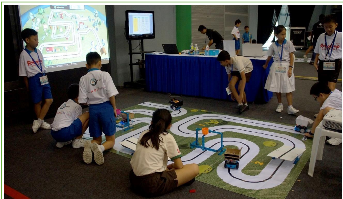
Figure 1: CoSpace Autonomous Driving Challenge

In the CoSpace Autonomous Driving Online Challenge 2021, students will only need to program the virtual robot and compete in virtual environment.