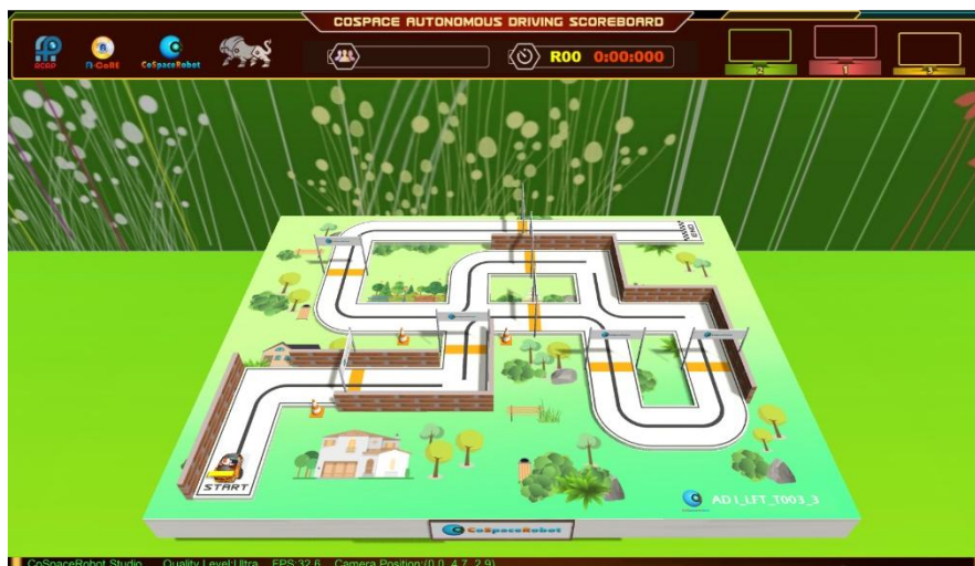
Figure 7: VIRTUAL_WORLD Layout