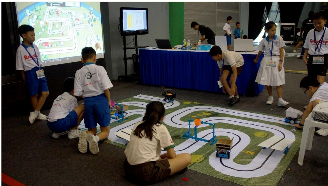
Figure 1: CoSpace Auto-driving Challenge

In the CoSpace Autonomous Driving FirstSteps, U12 category, students will only compete in VIRTUAL_WORLD.