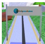
Figure 3: Example of a gantry