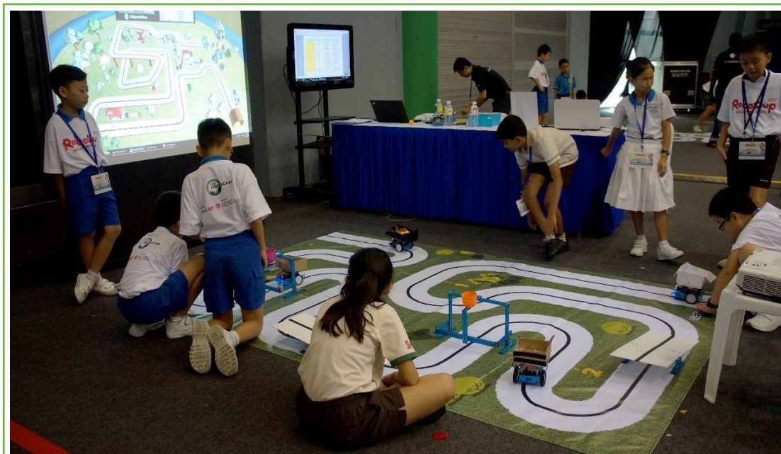
Figure 1: CoSpace Grand Prix Challenge

The CoSpace Grand Prix Simulator is the only official platform for the CoSpace Grand Prix Challenge. This simulator allows programs to be developed using a graphical programming interface (GUI) or C language. The same program for the virtual robot in the virtual environment can be downloaded on to a real robot in the real environment. Participating teams can contact support@cospacerobot.org for CoSpace Grand Prix Simulator download, help and assistance.