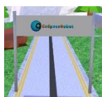
Figure 4: Example of a gantry

Gantry is an overhead assembly on which certain signs or signals are posted. Gantry will not block the road. The design and colour of gantries can be varied.