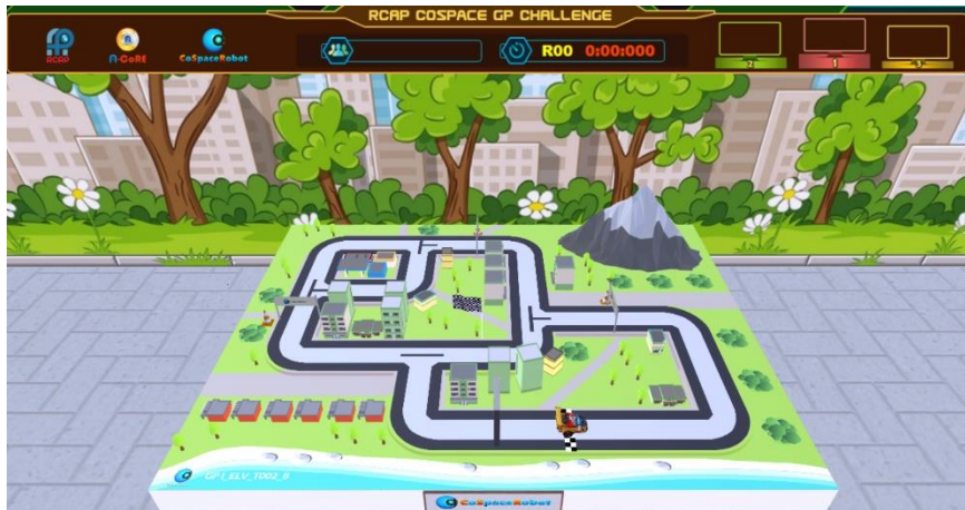
Figure 2: CoSpace Grand Prix Challenge (VRCAP Version), FirstSteps U12

Video Link: https://www.youtube.com/watch?v=P9R2DFHEdAQ